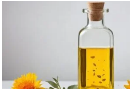
Safflower Seed Oil