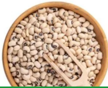
Black Eyed Beans