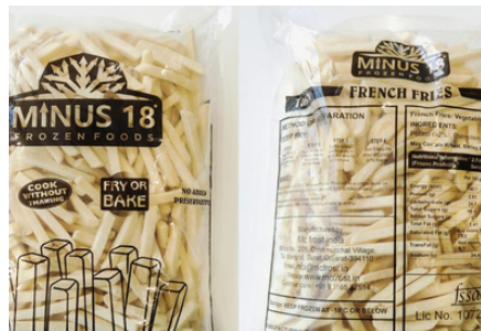
Frozen French Fries