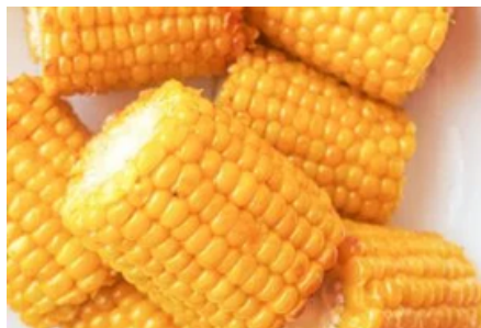
Frozen Corn Cob