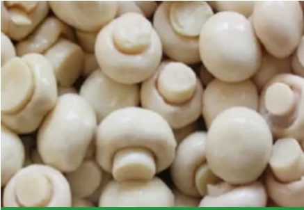
Frozen Button Mushroom