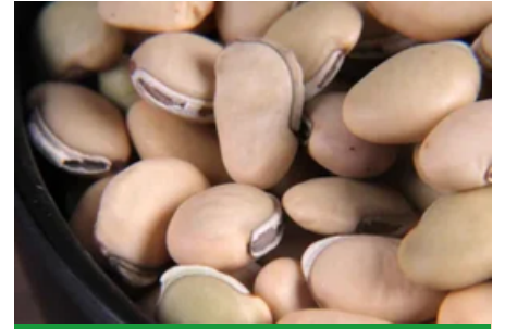
White Field Beans