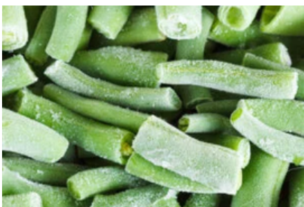
Frozen Green Beans