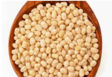
White Urad Dal Gota