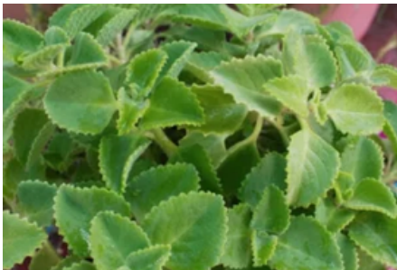
Carom Plant (Ajwain)