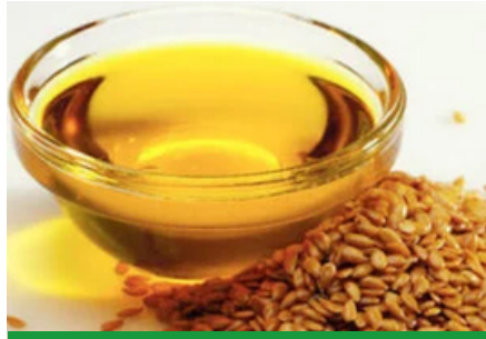
Flax Seed Oil