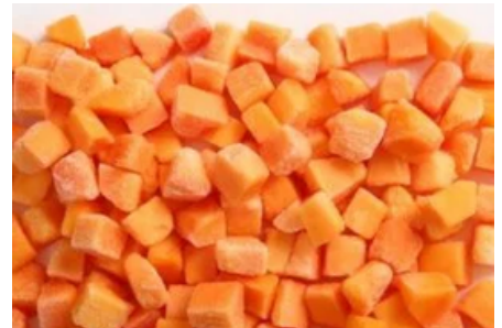
Frozen Carrot Diced