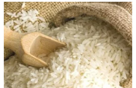
Wada Kolam Rice