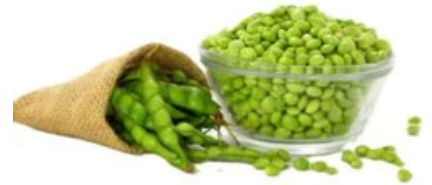
Green Pigeon Peas