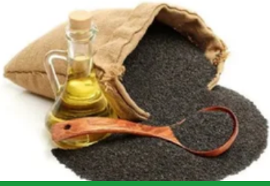
Black Sesame Seed Oil