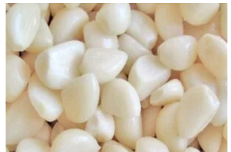
Frozen Garlic Cloves