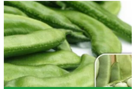
Papdi Hyacinth Bean