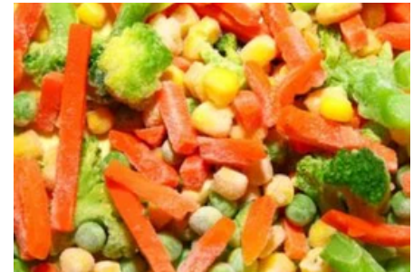
Frozen Mix Vegetables