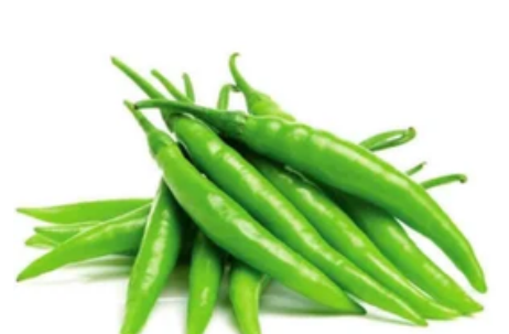
Green Chilli Pepper