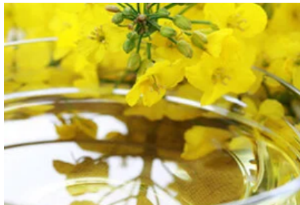
Spring Canola Seed Oil