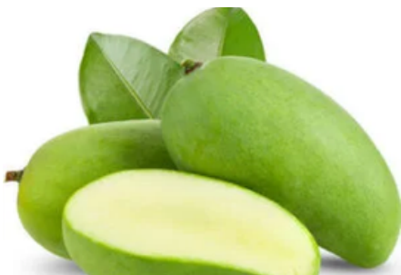
Raw Green Mango