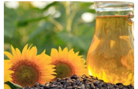
Sunflower Seed Oil