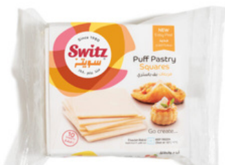
Frozen Puff Pastry