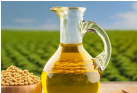
Soyabean Seed Oil