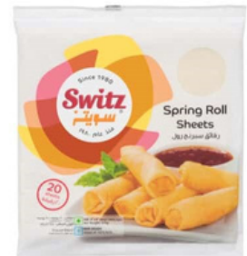
Frozen Spring Roll Sheets