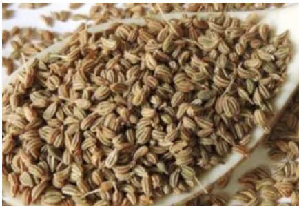
Carom seeds (Ajwain)