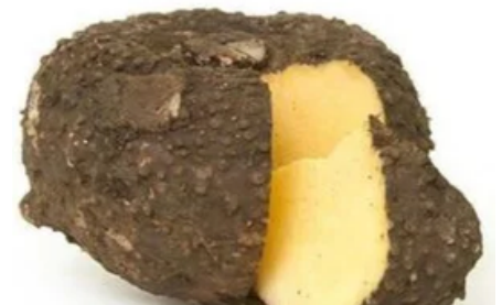
Elephant Foot Yam