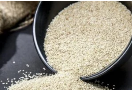
Poppy Seed - Khaskhas