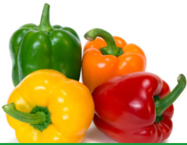
4 Color Bell Pepper