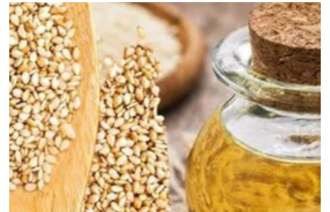
Sesame Seed Oil