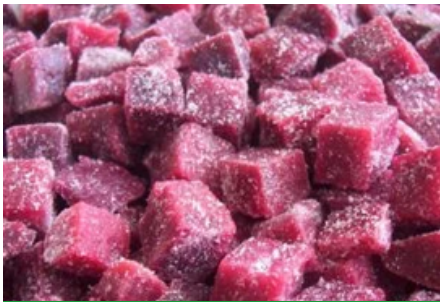
Frozen Beetroot Diced