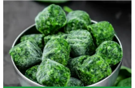
Frozen Spinach Cubes