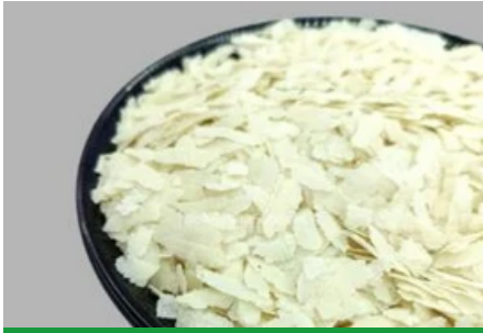
Beaten Rice - Poha