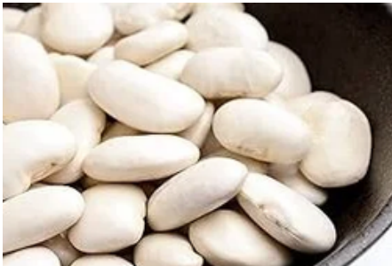
White Kidney Beans