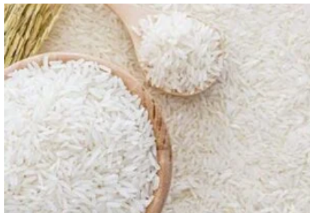
Lachkari Kolam Rice