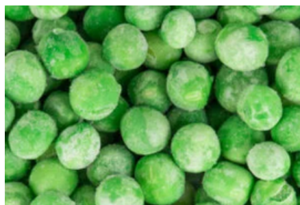
Frozen Green Peas