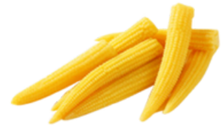
Frozen Baby Corn