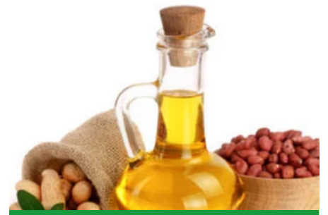
Groundnut Seed Oil