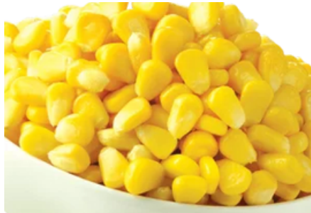
American Sweet Corn